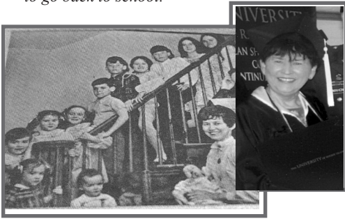
Pictured (L) many years ago with her 12 children and (R) URI Graduation 2010